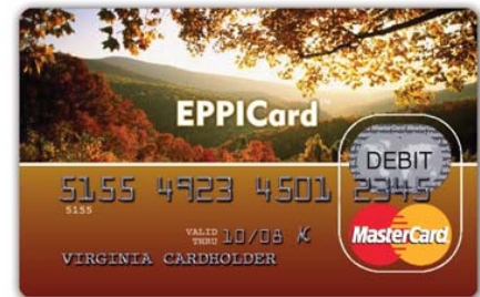
The Virginia Debit MasterCard® card is issued by Comerica Bank. ACS is an authorized representative of Comerica Bank.