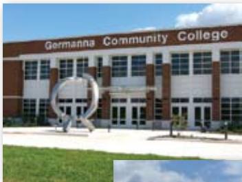
Joseph R. Daniel Technology Center in Culpeper